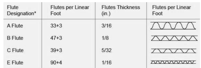
Table 1 Standard US Corrugated Flutes

The types of fluting vary depending upon how many flutes are included per foot, and how thick the fluting is. By experimenting with flute profiles, designers can vary compression strength, cushioning strength and thickness. Flutes come in several standard sizes such as A, B, C, E, and F. Different flute profiles can be combined in one piece of combined board [1].