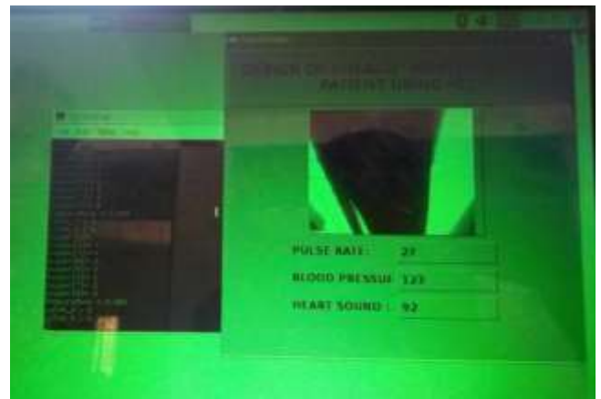
Fig 3: Sensors output in GUI page of Raspberry Pi Monitor