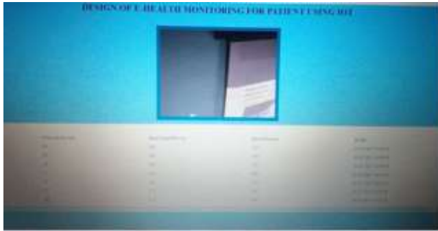
Fig 4:Raspberry Pi web server output in client internet browser.

specific sensors and monitor it on a graphical user interface monitor screen; Also can be monitored on the internet web page by connecting each Raspberry Pi Board to the Internet source using raspberry pi's inbuilt Wi-Fi and the internet network's SSID and password, and requesting each patient's E-Health parameters through each patient's Raspberry pi's unique IP address in the Internet web browser.