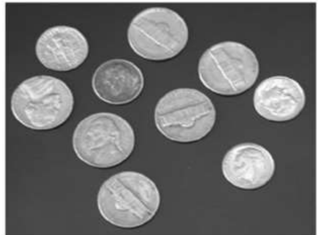
Fig. 3 Input Image (coins).