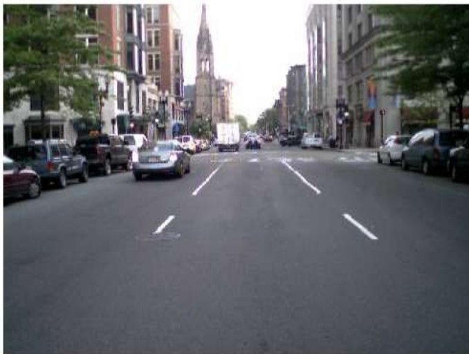
Fig. 5 Input Image (street)