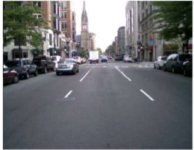
Fig. 7 Upsampled Image (Street).