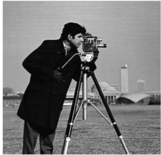
Fig. 3 Input Image (cameraman).

Fig. 5 shows another colour input (street) image is of size 480 x 640 x 3 in in png format. Fig. 6 shows the decimated image of the same which is of size 240 x 320 x 3 and Fig. 7 shows the expanded image of the same input which of size 960 x 1280 x 3, by a factor of 2 each. The times taken for performing the upsampling and downsampling operation for the coins.png image are 2.301 second 1.451 seconds respectively. There are no blocking and ringing artefacts in the output images.