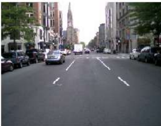
Fig. 6 Decimated Image (Street).