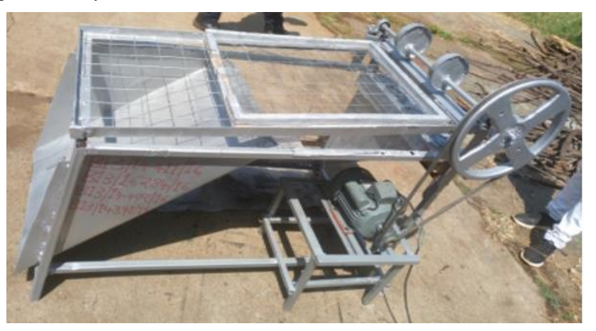
Figure 1: Designed Semi-automatic Sand Screening Machine

The shaft will exert a centrifugal force on the machine to assist in sieving the sand as it rotates on pillow block bearings at both ends of the sieve. Because of the forces and motion happening on the machine, the smaller sand particles that are smaller than the sieve mesh are driven out of the sieve. Larger particles that cannot pass through the sieve fall off the sieve by rolling down to the other opening end of the sieve by gravity. Effect of moisture content in the sand and sieve size on the sieving time of sand and quality/quantity of the output was analysed.