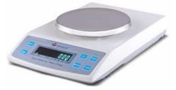
Figure 2: Balance Machine

As a result of the vibration mechanism, the fine sand aggregates fell at the bottom of the sieve and collected at the lower section. The coarsest sand aggregates will not pass through the sieve and hence will be collected at the opposite section of the vibrating table to avoid mixing with the already-sieved fine sand.