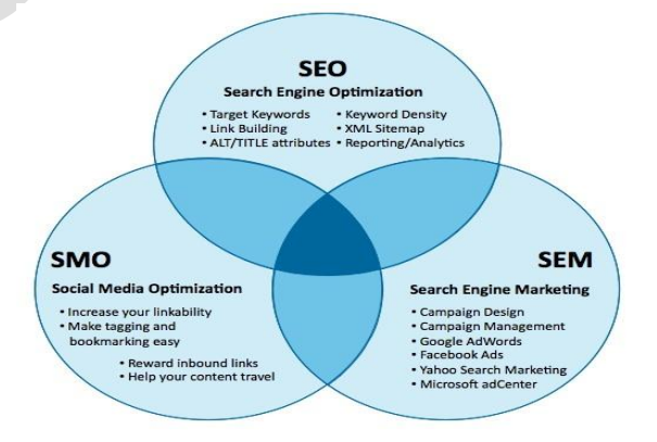
Figure 2: Functionality of SEO, SMO, SEM

There are many ways such as SEO to promote an online site. But the power of rapidly growing Social Media Optimization shortly called as is still not familiar in some parts of the world. Social media optimization is similar to all the other optimization techniques that are used for the promotion of online web sites. Basically, this process increases the visibility and popularity of the website faster. The principle that work behind SMO is to draw traffic.