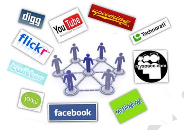
Figure 3: Provide Platform for Social Media Marketing

report titled introducing the New Social Techno graphics, 75 percent of online consumers read or view social content from networks. This presents a significant opportunity for small businesses to use the social Web to spread the word about their companies and build relationships with customers. But many business owners hesitate, as they aren't quite sure how to get.