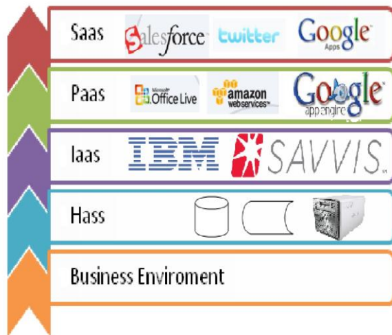
Fig 2 the Architectural layers of cloud computing

storage and networking equipment. Figure 2 depicts the Architectural layers of cloud computing.