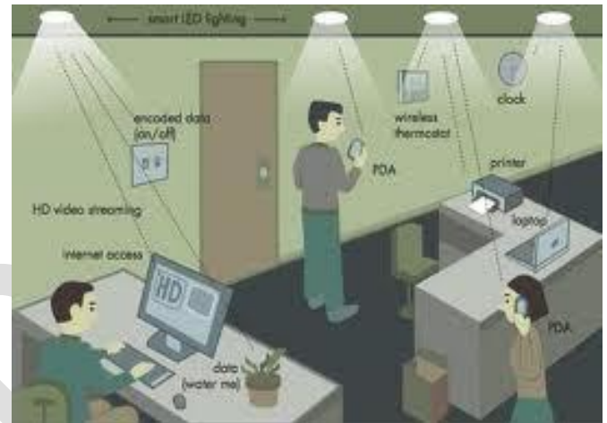
Fig.1 Li-Fi environment