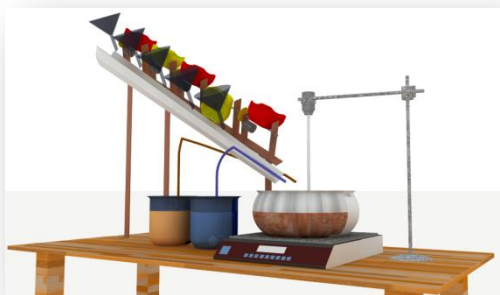
Figure 1- Front view of cooking machine.

In the above fig.1 of cooking machine each ingredient is added step wise with addition of oil and water with the help of motor and limit switches.