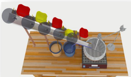
Figure 2-Top view of cooking machine

In the above fig.1 of cooking machine each ingredient is added step wise with addition of oil and water with the help of motor and limit switches.