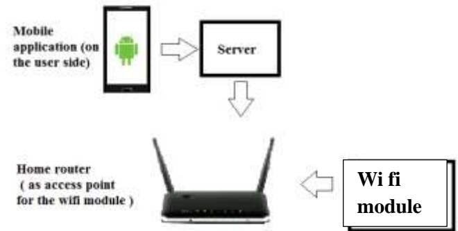
Fig 3. Actual set up of switching unit

In the present system everything is monitored and controlled manually. Only analog systems are there for power verification and cross checking. The security provided at the grids and homes is not up-to the mark. The controllers used are very primitive with lesser operating frequency and durability.