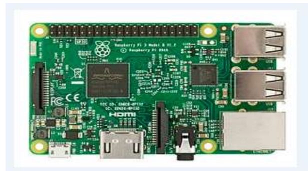
Fig 1. Raspberry pi board

On the other hand, some articles consider standalone micro grid configurations while others try to develop grid-tied PV-based schemes. To convert DC voltage of the PV arrays to a compatible AC grid voltage, an appropriate inverter is required. Depends on the modality of the system (GT or standalone), the control strategy differs. In grid-tied PV-based systems, the main objective of the inverters' controller is controlling the behaviour of the injected current to the grid. However, in standalone PV -based systems the main objective is controlling voltage in the point of common coupling (PCC). In case of double-mode micro grids, designing a reliable controller which is able to work in both standalone and GT modes is an important issue.