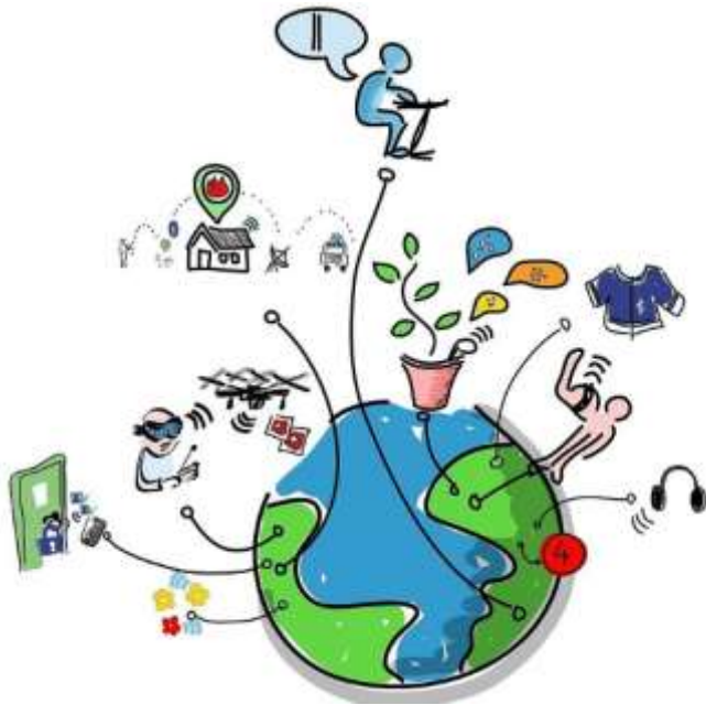
Fig 3. Drawing representing IoT