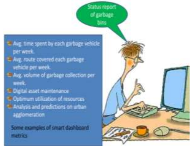
Fig.3 Smart Reporting

situation in a clever manner but will also improve the economy of our country.