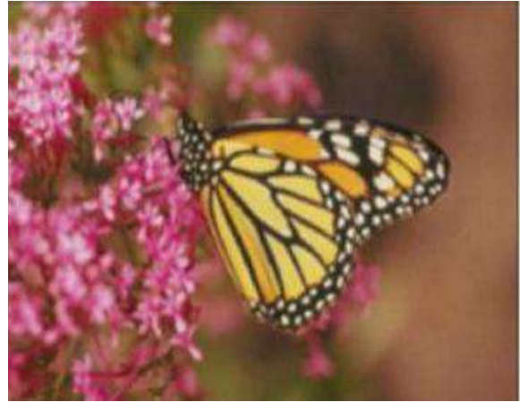
In Fig. 3 Weiner filtered Image, here we are applying wiener filter to smooth an image as in the original resolution of image