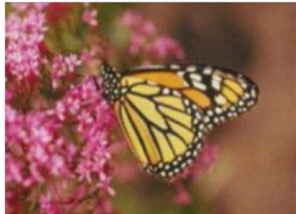
In Fig. 5 Upscale Image, here we obtained an upscale image for the use of creating a dictionary.

Which is of same resolution of the input image.