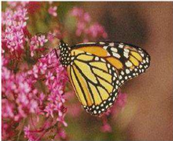
In Fig. 2 Original Image, we are simply taking an image from live database and perform further operation.

In this section we are briefly describe the live database [18]. For the construction of training data, we randomly chose images on a public website. The experiment is performed on a PC running a single core of Intel Pentium 3.0 GHz CPU. We are using the MATLAB 13a for execute it.