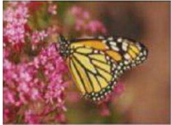
In Fig. 4 Low Resolution Image, we apply a resize function on the original image and obtained a low resolved image as output. Which of half of the size of input image.