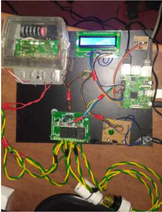
Figure 3: Working Model of our Project

graphs. The entire implementation is being taken place in PYTHON surroundings. From the results it has been concluded that if there is any dishonest user then government person can find that dishonest user.