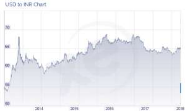
Exhibit 2: Past five year chart for Indian Rupee against US Dollar [6]

Exhibit 2 indicates past five year chart for Indian Rupee against US Dollar.